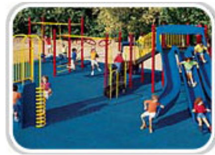
Poured in Place – rubber and urethane components